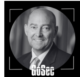
Admiral James Stavridis Vice President, Global Affairs, at The Carlyle Group