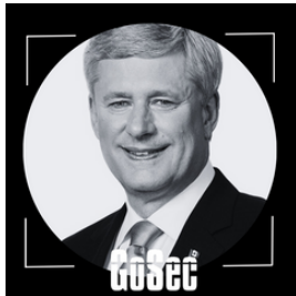
The Right Honourable Stephen Joseph Harper Founder and President of Vision One

SINCE 2003, GOSEC HAS BEEN COMMITTED TO SHOWCASING THE MOST INFLUENTIAL FIGURES IN THE FIELD OF CYBERSECURITY